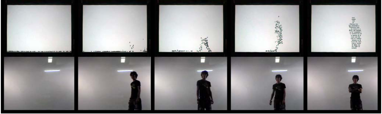
Figure 2: Still Standing showing progression of interaction to inter-inaction.

letters drop away from her and resume their interaction with her active movement. However, if the user stays in a state of motionlessness for more than seven seconds, the letters will move up, like water soaking up her body, to become more and more legible. Slowly, words and sentences form within her silhouette until the entire text can be read.