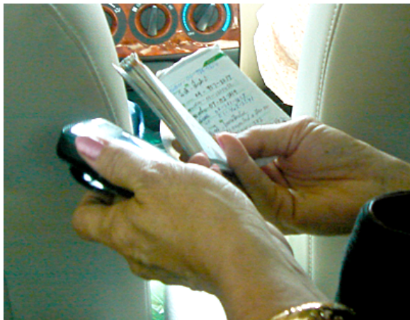
Figure 3: Mobile phone with paper address book.

While participants found the local mobility of their phones to be useful (even indispensable), the transnational mobility of the device and the people who use it was more problematic. Despite the presence of a contacts list on their cell phones, many participants had not abandoned the practice of keeping paper address books. A few even kept a small one that they carried with them everywhere, along with the mobile phone. Cell phone contact lists are ill-suited for making international calls with a calling card, and this was an activity that many participants engaged in regularly. A calling card call requires first dialing a