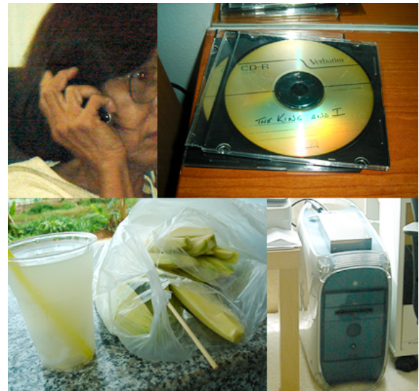
Figure 2: Material items exchanged within a distributed household: cell phones, banned movies, green mango, and computers.

The Thai word, bâhn (the accent mark indicates a falling tone), typically used for “house” is also frequently seen preceding village names in rural Thailand. Indeed the network of exchange we participated in in Chantaburi was spread over several distinct built dwellings, constituting something perhaps more loosely knit than a single nuclear household, but more closely knit than what one might typically term a neighborhood.